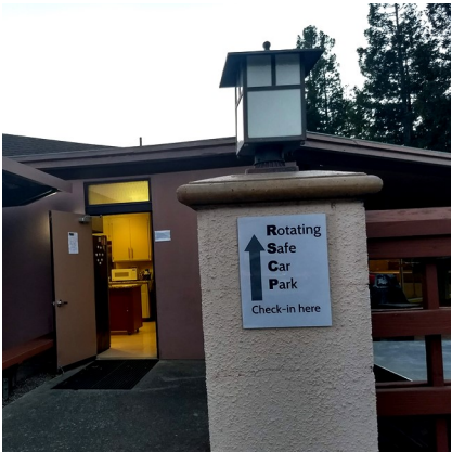
Lights on and doors open for Rotating Safe Car Park!

We are thankful to the members of Prince of Peace who have supported this important ministry through their many encouraging comments, their donation of time, and their prayers.